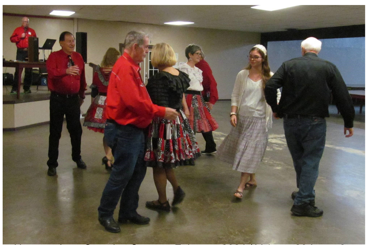
Houston Area Camping Squares February 2024 / Volume 20 Issue 2