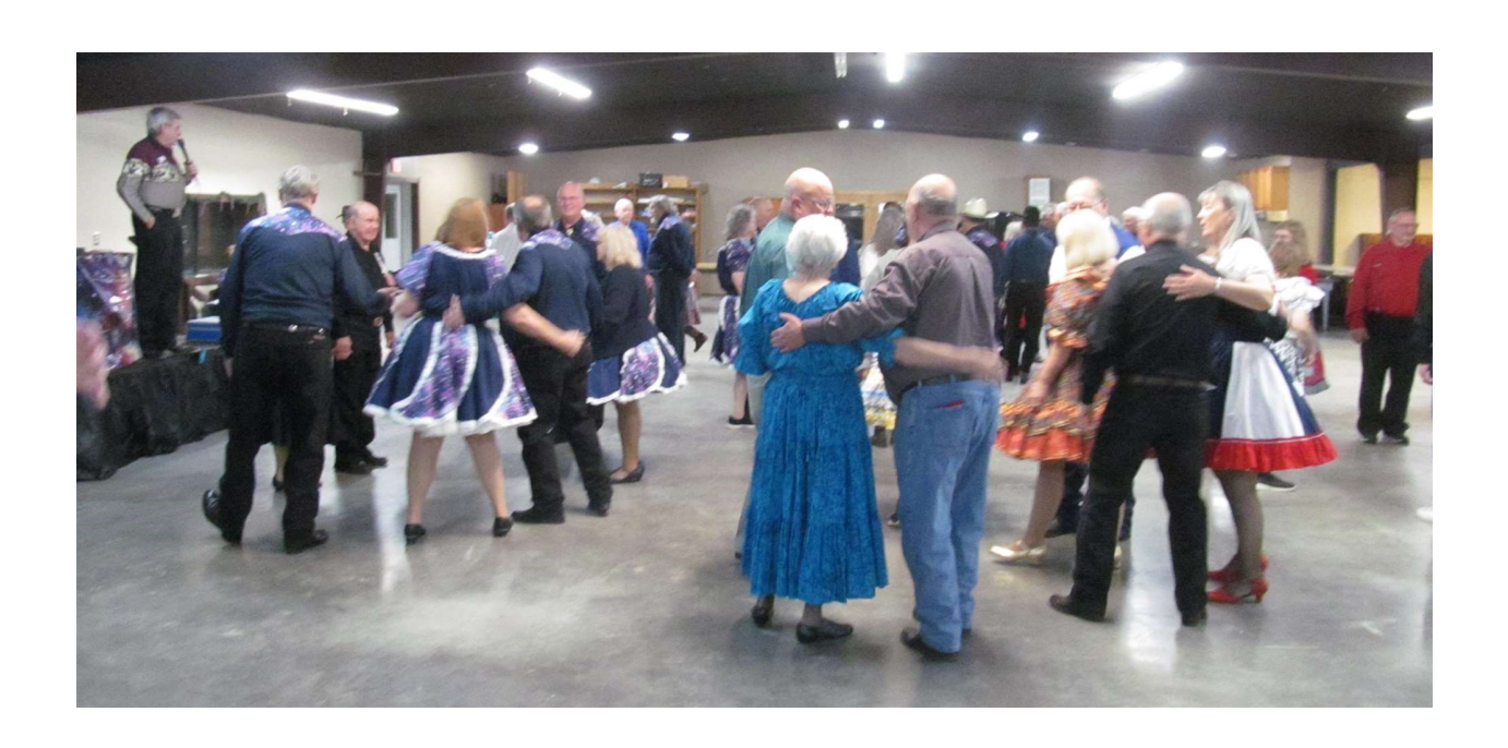
Houston Area Camping Squares February 2024 / Volume 20 Issue 2 12