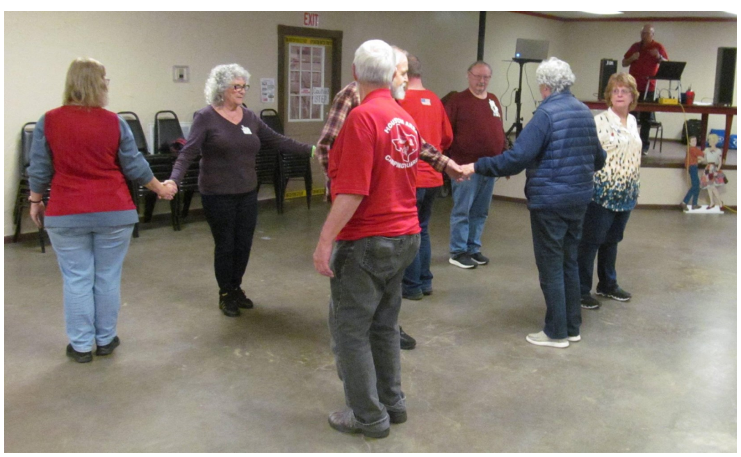
Houston Area Camping Squares February 2024 / Volume 20 Issue 2 7