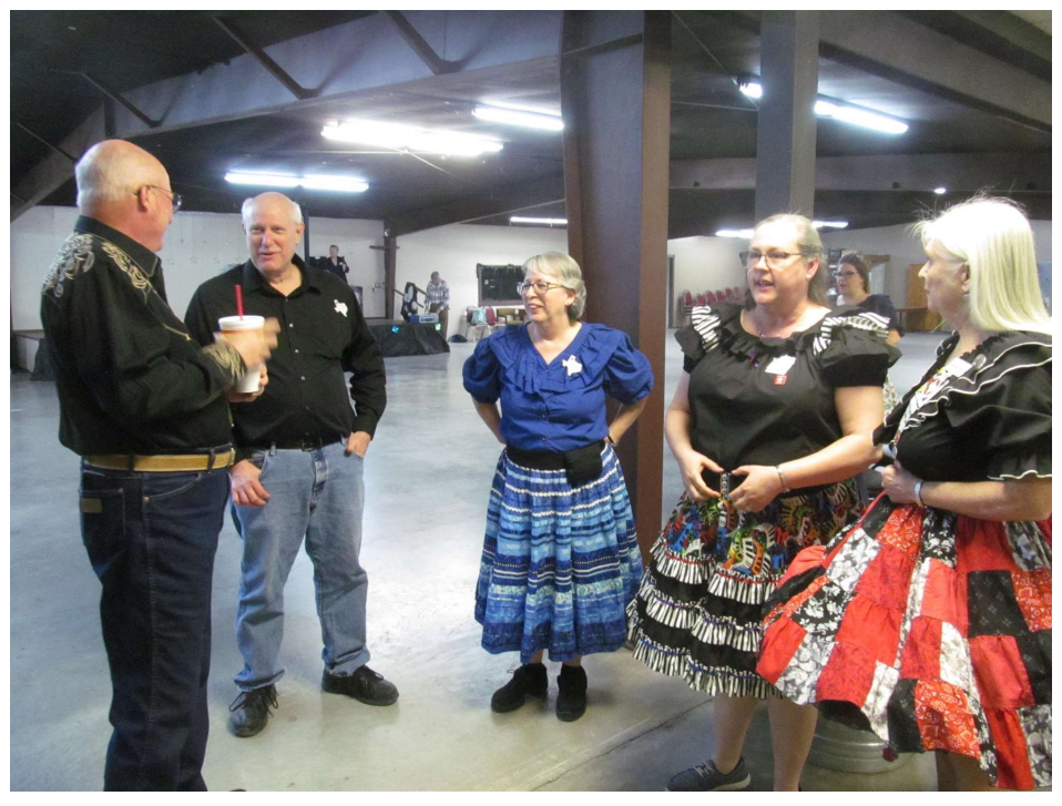
Houston Area Camping Squares February 2024 / Volume 20 Issue 2 11