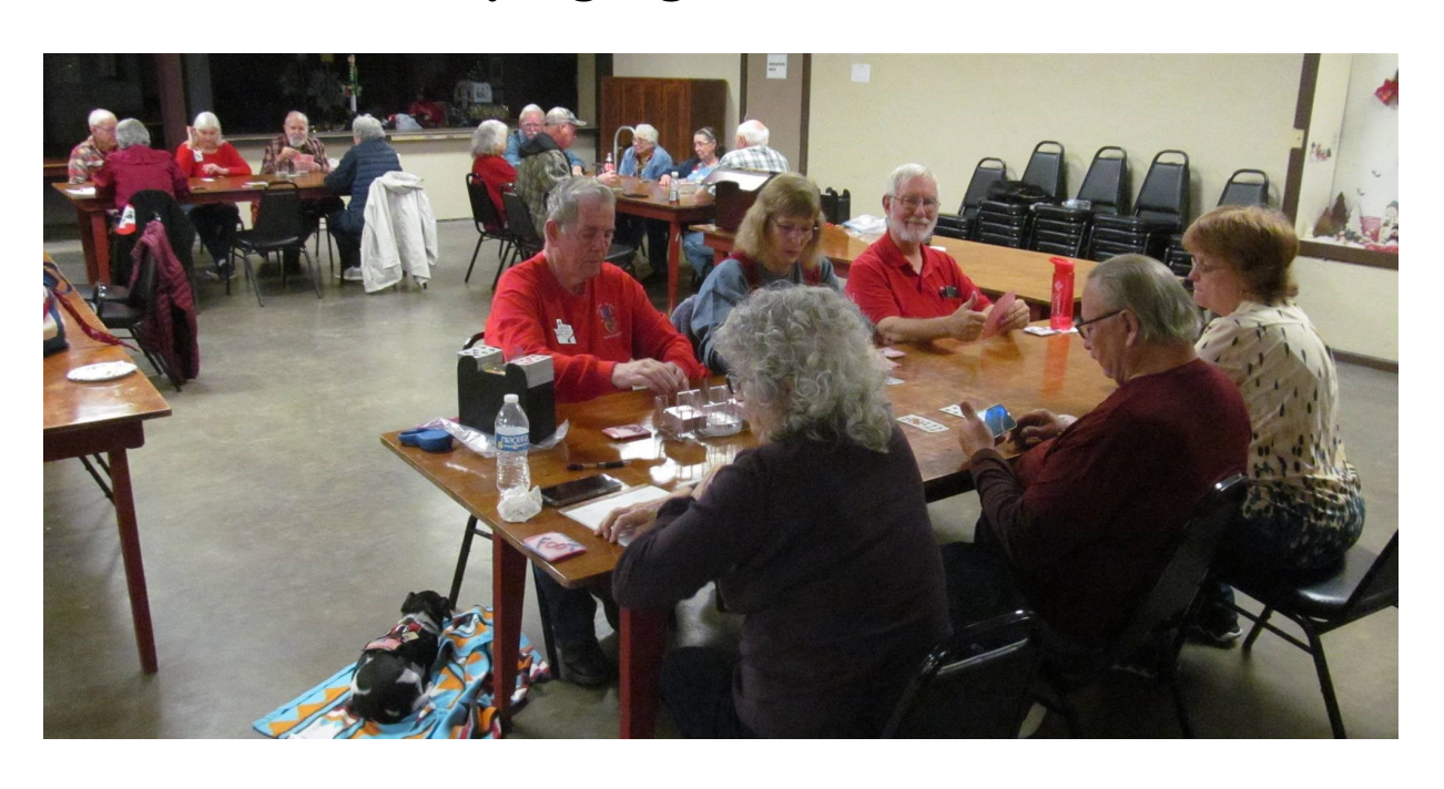
Installation of officers Jan. 6, 2024